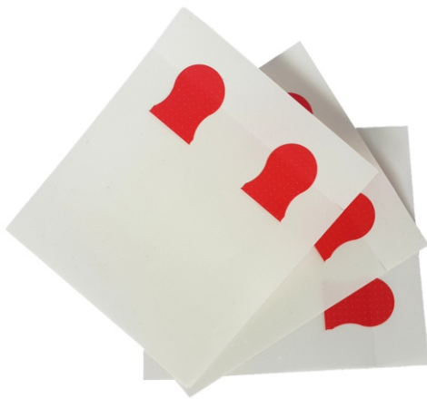
05TD0012 Eye Safety Tape Adult