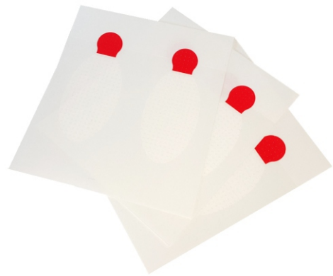
05TD0020 Eye Safety Tape Pediatric